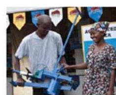
3. Upon complete payment, customer picks up pump at dealer shop.

Now in pilot stage, 117 customers are registered, and 56 have already paid in full and received their pumps! Mobile Layaway: