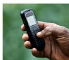
2. Customer sends an initial deposit and additional payments via M-PESA's Pay Bill service.