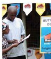
1. Customer fills out registration form with Sales Rep or at Dealer.

KickStart has designed and introduced an exciting new solution to get more pumps into action: micro-payments via cell phones. Mobile Layaway, marketed as “ Tone Kwa Tone Pata Pump ” (Swahili for “Drop by Drop Gets the Pump”) enables customers to make mobile payments of any amount, at any frequency, using M-PESA, a mobile money transfer system used by over 13.5 million subscribers in Kenya. Mobile layaway provides a convenient, secure method of saving up for a MoneyMaker pump, and helps customers commit to the purchase before they have the full amount.